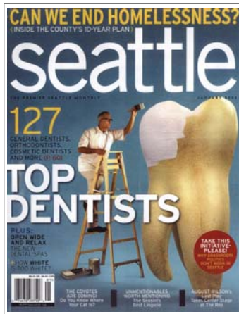
SEATTLE MAGAZINE, JANUARY 2006