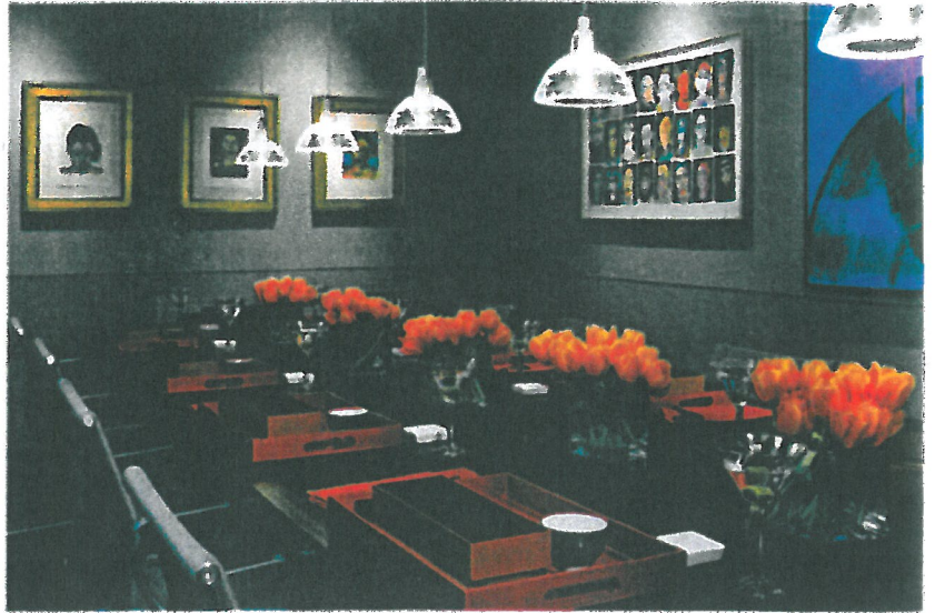
Meeting rooms in the Hotel Max, in Seattle, showcase emerging local talent.