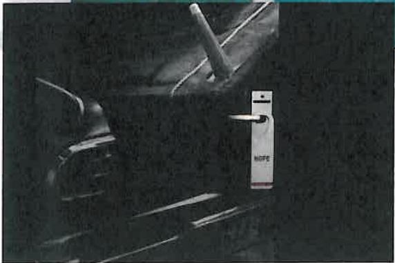
Clockwise from top left: Awaiting a shower in Max's signature water closet; Branimir stretches out, hoping to grab a sniff of something delicious near the entrance to Red Fin; the Max's version of "Do Not Disturb" sign on room #417.

milk bones with her nose, indicating to me that I'd best remove them from the bag before she consumed the entire package. I complied.