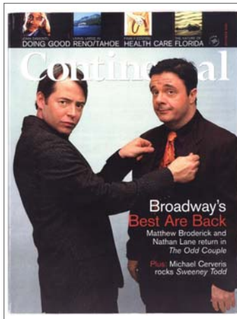
CONTINENTAL MAGAZINE, OCTOBER 2005